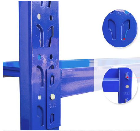
wider grounding lug, more stable